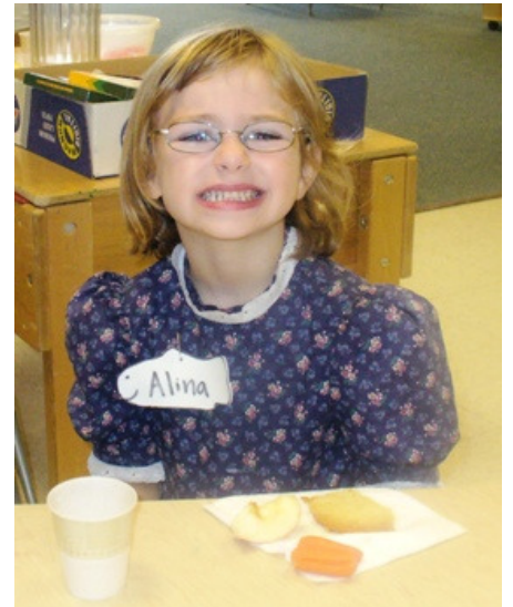
Cookies and fruit for snack time.