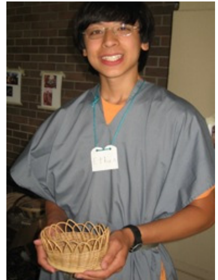
A finished basket.