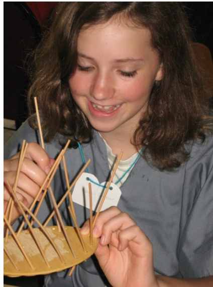
Weaving a basket.