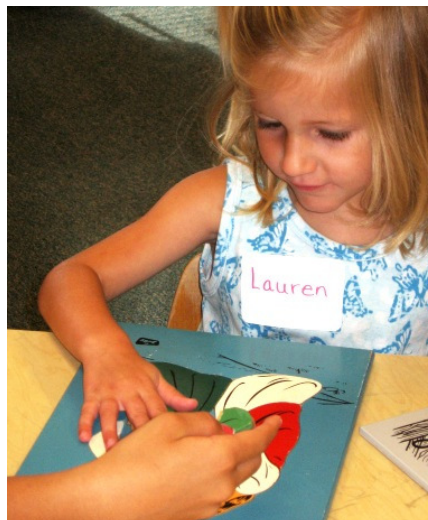
Working on a puzzle.