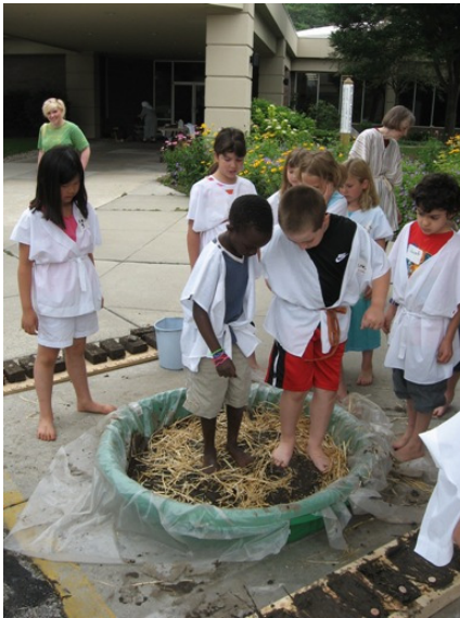
Mixing straw and clay to make bricks.