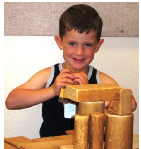
Playing with blocks.