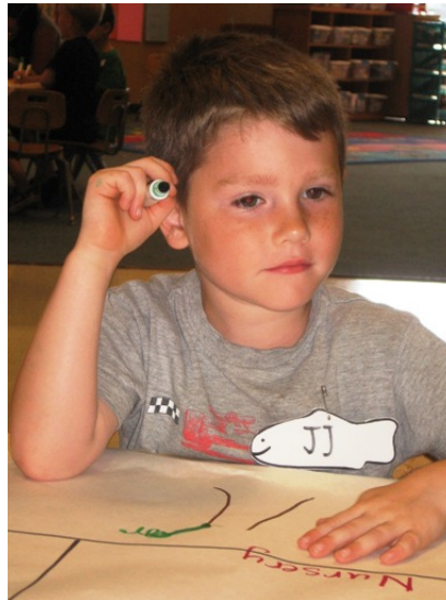
Coloring a big picture of a hospital.